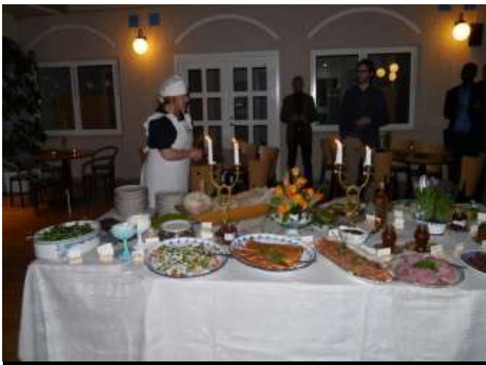
with the locally sourced and produced sumptuous Swedish food