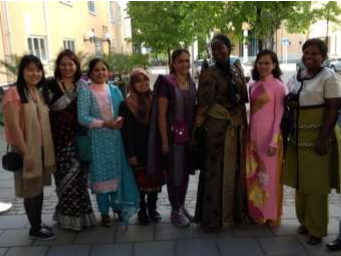
Some of the participants...

Towards the end of the Spring 2013, we welcomed participants from Africa, Asia and Latin America to Karlstad for the ICT and Pedagogical Development training program, ICT 2013A.