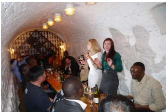
WP2013B Participants' Get-Together in