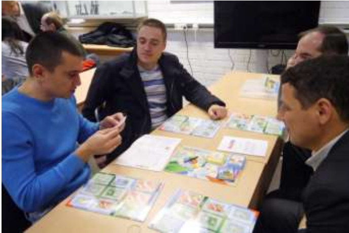
Learning Energy efficiency through