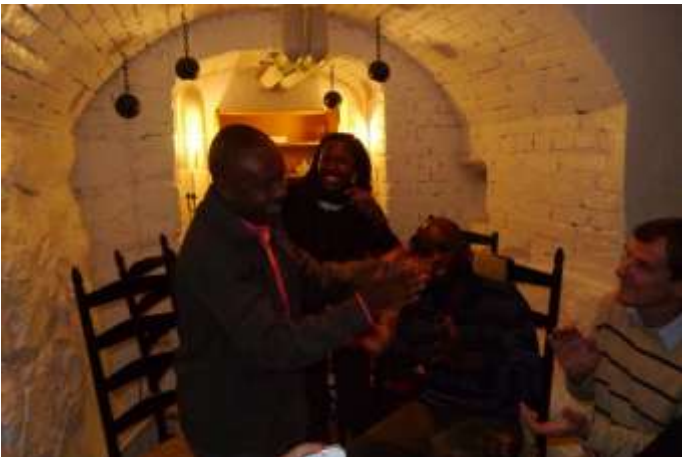
setting the mood for the participants' get-together at Hotel Bilan, Karlstad.