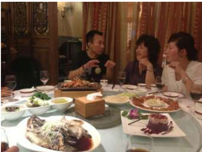
Workshop in Beijing, good food combined with interesting discussions.