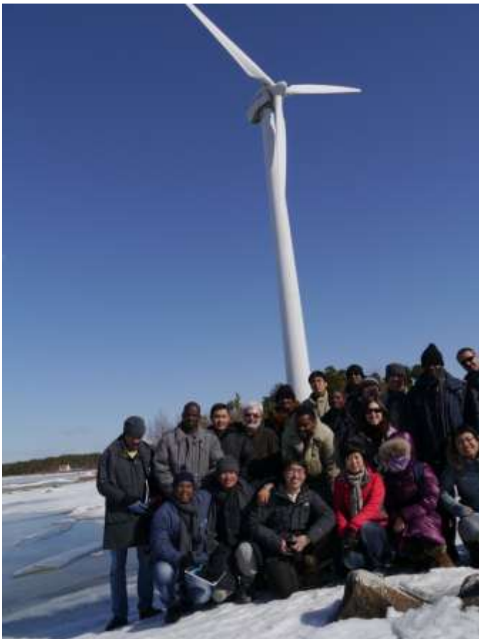
WP 2013A group in Karlstad, Sweden.

In April 2013, we had the pleasure to meet the WP 2013A group in Karlstad. The program covered visits to Stockholm, Malmö, Copenhagen (Denmark) along with some west coast areas in Sweden.