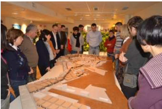
EE 2013C group during study visit at