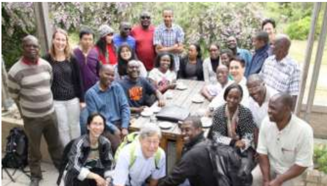
EE 2012B group in Cape Town, South Africa

During the Fall 2013, we also organized a Regional Phases for various group within Energy Efficiency, Wind Power and ICT.