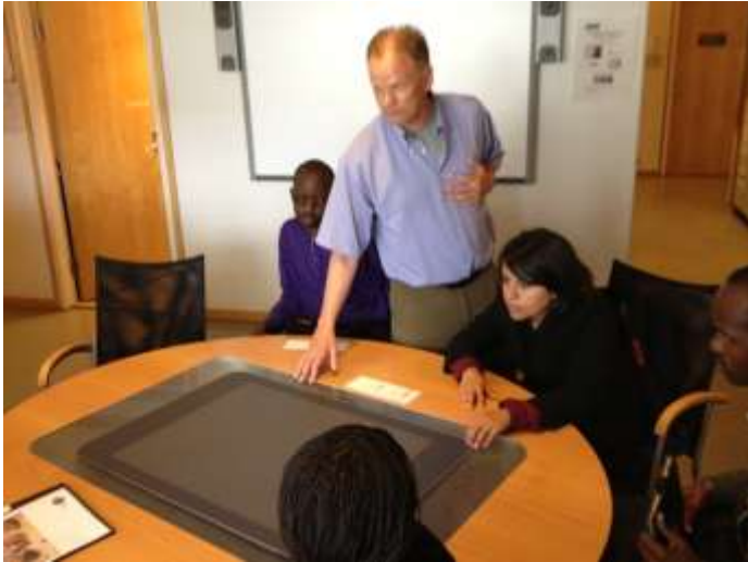
ICT 2013A group exploring the latest ICT practices in Sweden.

The beginning of Summer 2013 marked the workshops in Tanzania and Beijing for our Energy Efficiency group, EE 2013A.