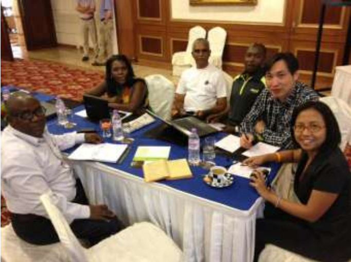
Regional Phase for EE2012 in New Delhi, India.