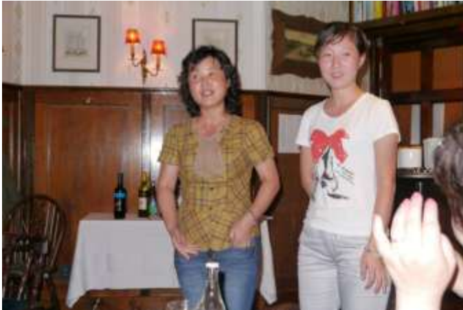
Cultural exchange through music in the EE