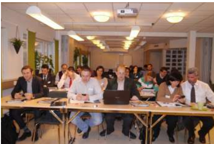
EE 2013C group settling in for the start of the training at LIFE Academy premises, Karlstad.

During the onset of Winter 2013, we administered the Sweden phase of the Energy Efficiency group; EE 2013C which was unique with a homogenous set of participants from Eastern EEurope.