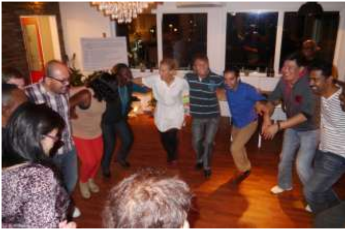
and the rest join the fun. It was an evening to remember!

During the Fall 2013, we also organized a Regional Phases for various group within Energy Efficiency, Wind Power and ICT.