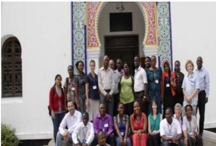
Workshop in Tanzania, participants visit the Museum of Culture, an energy efficient building in Tanzania.

The beginning of Summer 2013 marked the workshops in Tanzania and Beijing for our Energy Efficiency group, EE 2013A.