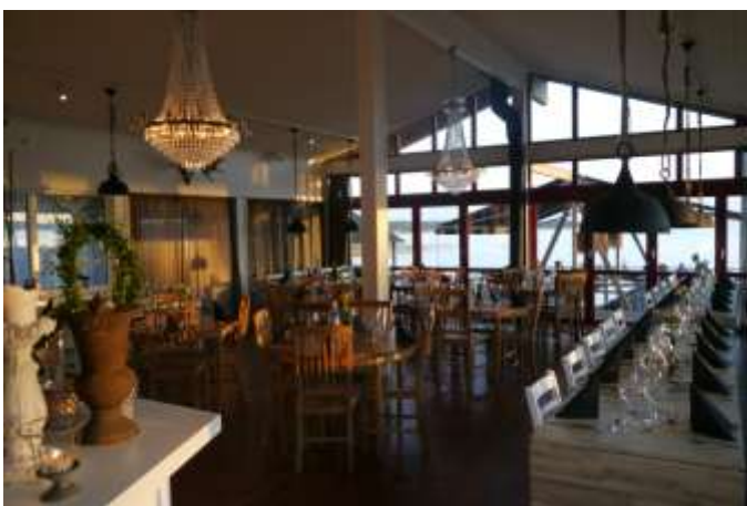
The scenic Mörudden party hall welcomes

Besides a higher efficiency in creating Change Agents, the overlapping gave us an opportunity to bring the two groups together through a common Participants' Party.