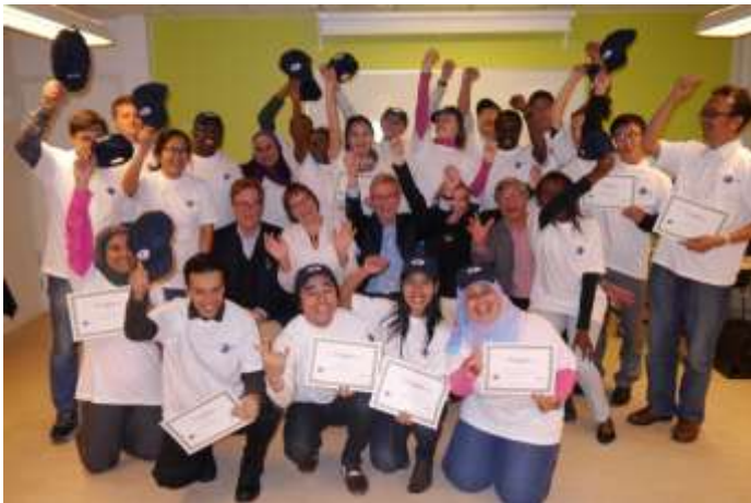
WP2012B group concluding day.

Year 2013 also saw the Regional phase of the WP2012B group in Chennai and Kanyakumari, India.