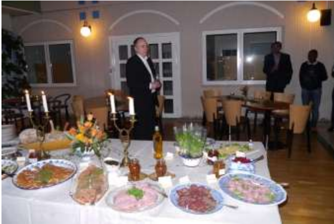
EE 2012 group were welcomed by representatives of the Region Värmland