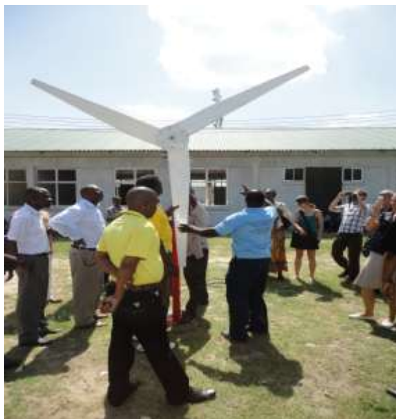
WP 2013A Workshop in Tanzania. Study visit to a wind farm in Dar-es-Salaam.

The year 2013 opened with our Wind Power Program with two very successful workshops in January (Shanghai and Tanzania). The Regional phase concluded with the group visiting Chennai and Kanyakumari in India in November.