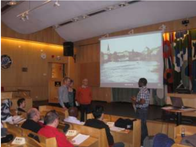
EE 2012B group visiting the Karlstad Kommun Advisory Center to learn about the energy efficiency strategies.

Year 2013 also saw the Regional phase of the WP2012B group in Chennai and Kanyakumari, India.