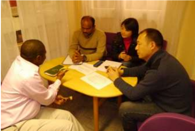
Serious discussion under way to develop wind power in Asia and Africa.