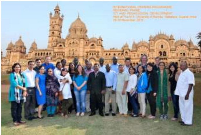
ICT 2013A group attending Regional Phase in Gujarat, India.

During the onset of Winter 2013, we administered the Sweden phase of the Energy Efficiency group; EE 2013C which was unique with a homogenous set of participants from Eastern EEurope.