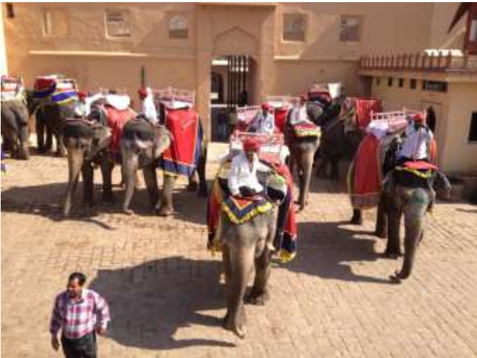
The EE2012 group receiving a majestic welcome in India.

We also had the Regional Phase for the Energy Efficiency (EE2012) group during Spring 2013 in the Northern India.