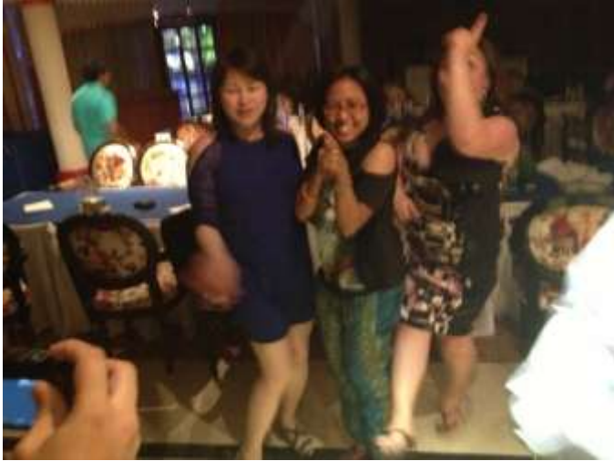
Combining work with fun!

In April 2013, we had the pleasure to meet the WP 2013A group in Karlstad. The program covered visits to Stockholm, Malmö, Copenhagen (Denmark) along with some west coast areas in Sweden.