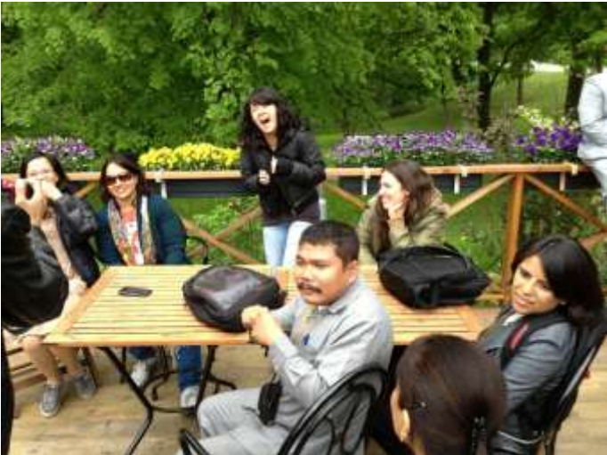
and a few more...