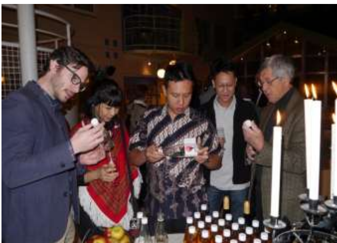
and drinks... to give our participants a taste of the Swedish cuisine.